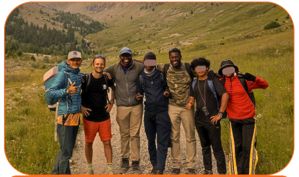
During the hike, accompanied by young people

I was lucky enough to take part in the Trophy Sports Adventure at the end of June. When I arrived, the organizers gave me a warm welcome. Right from the start, I felt at ease sharing my life story, hoping to inspire youth to go beyond their limits. When I finished telling my story, the youths were silent for a few seconds, and then some of them shook my hand, congratulating me on my courage and on what I was able to achieve despite everything.