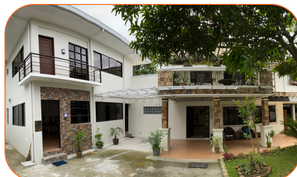
The Skills Hub building

ACAY's commitment to thinking big for its youth instills hope for a better future and facilitates their successful integration into the workforce. Within the Skills Hub, the team provides a dynamic space encompassing theoretical modules and practical hands-on experiences for piloting and developing income-generating projects.