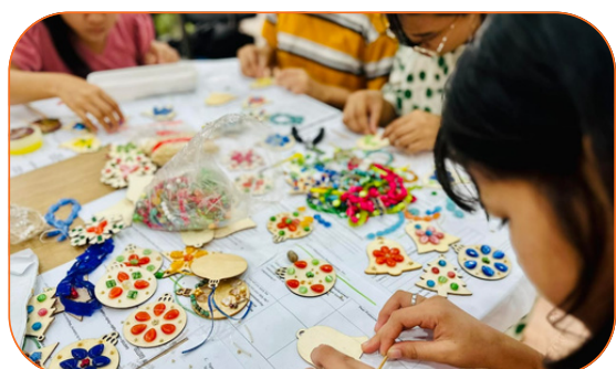
Production of Christmas decorations

Through the hands-on training provided to participants, they are equipped with the ability to conceive and execute income-generating projects, coupled with the skills to plan, evaluate, budget, and uncover individual talents. All of these contribute to them regaining or rebuilding their self-confidence – something that ACAY emphasizes in all of its flagship programs, capacity-building activities, and other training events. This transformative process provides participants with newfound motivations to exceed personal boundaries.