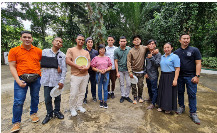
Alumni of the Second Chance Program with members of the team

Sister, I was given to my aunt and brought to France without even knowing that I would never see my family again..."