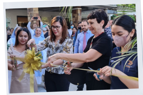
Ribbon Cutting Ceremony