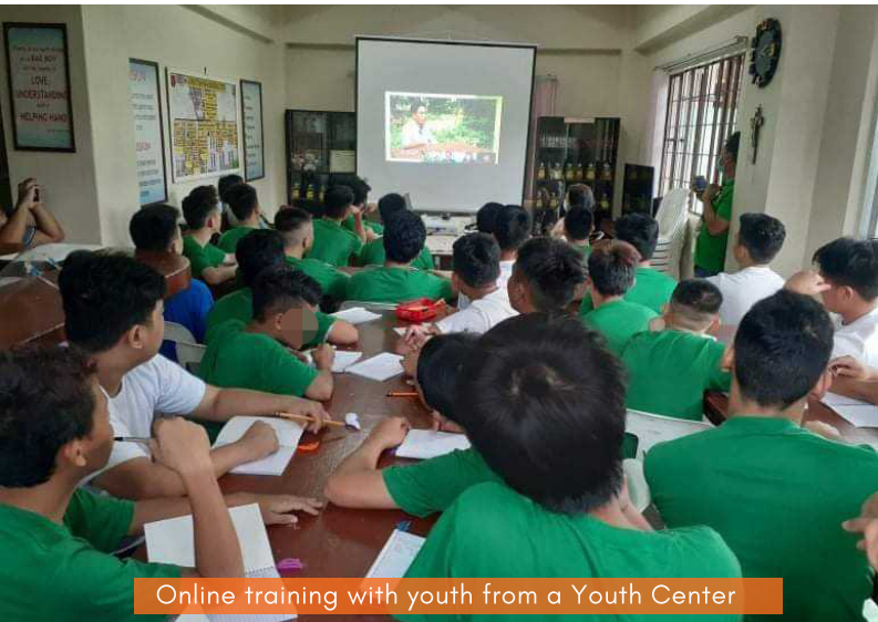
Online training with youth from a Youth Center

In this period of uncertainty and ever-pervasive challenge, the operation of the Second Chance Program (SCP) has evolved in a spirit of creativity and innovation.