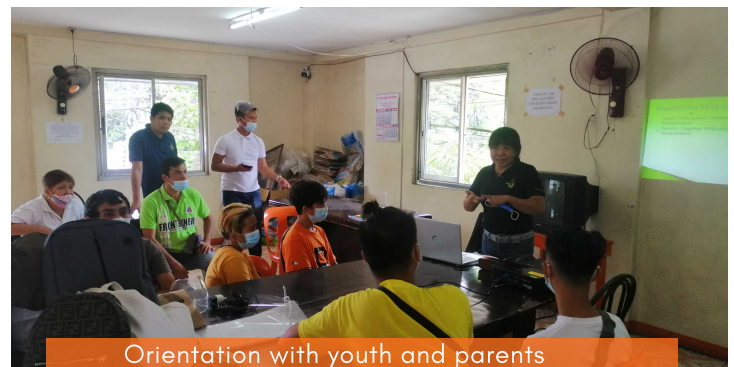
Orientation with youth and parents

In the two Youth Homes, where we have also signed an agreement, we will train forty youth for three months using the GOAL training program. One of our previous partners, a Branch of the Family Court, has entrusted us with five youth under their diversion program for weekly online training.