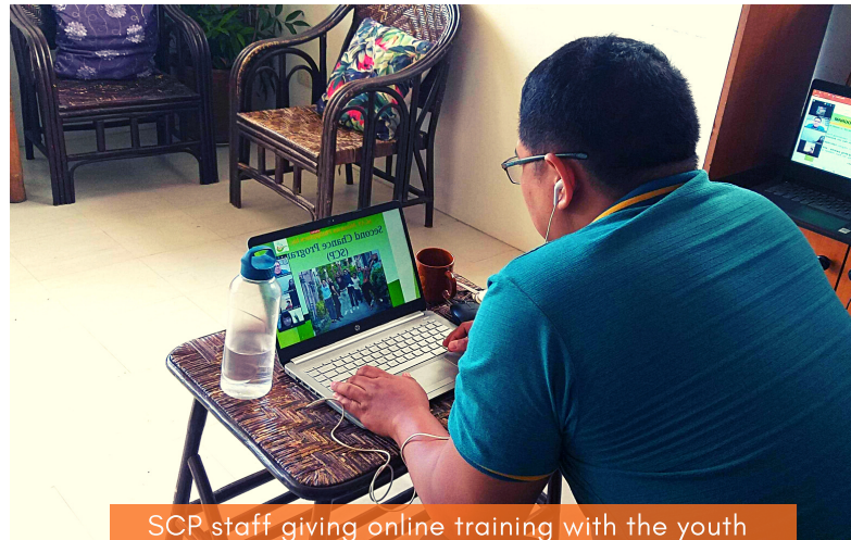
SCP staff giving online training with the youth

During our first visit to the District Office whilst formalizing the official documents for this new partnership, families and children arrived in the hall where we were received. Seven youth aged 15 to 20 listened to our presentation and shared their first impressions. Home visits followed to see the reality of their lives. These young guys, usually "working" in their gang, expressed their joy that, for the first time, they felt that people wanted to help them change their lives.