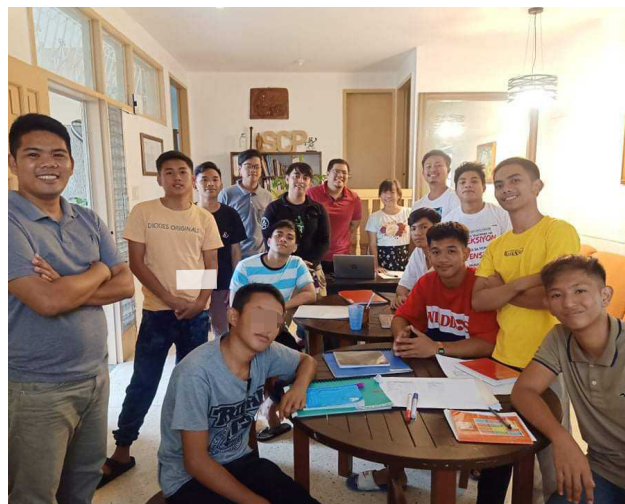
Aftercare subprogram beneficiaries with SCP staff

All that they taught me about resolving unresolved issues, anger management, and peer pressure is so relevant for my life. Thanks for helping so many youths find direction in life."